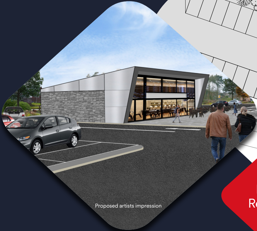
Proposed artists impression

0.3-acre site with potential for Drive Thru use